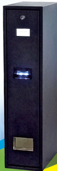
EX-1500 (With LCM)