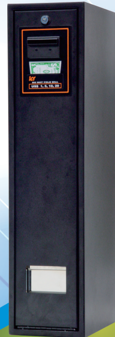
EX-1000 (Without LCM)